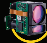
Laser Range Finder