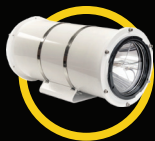
High Powered Searchlight